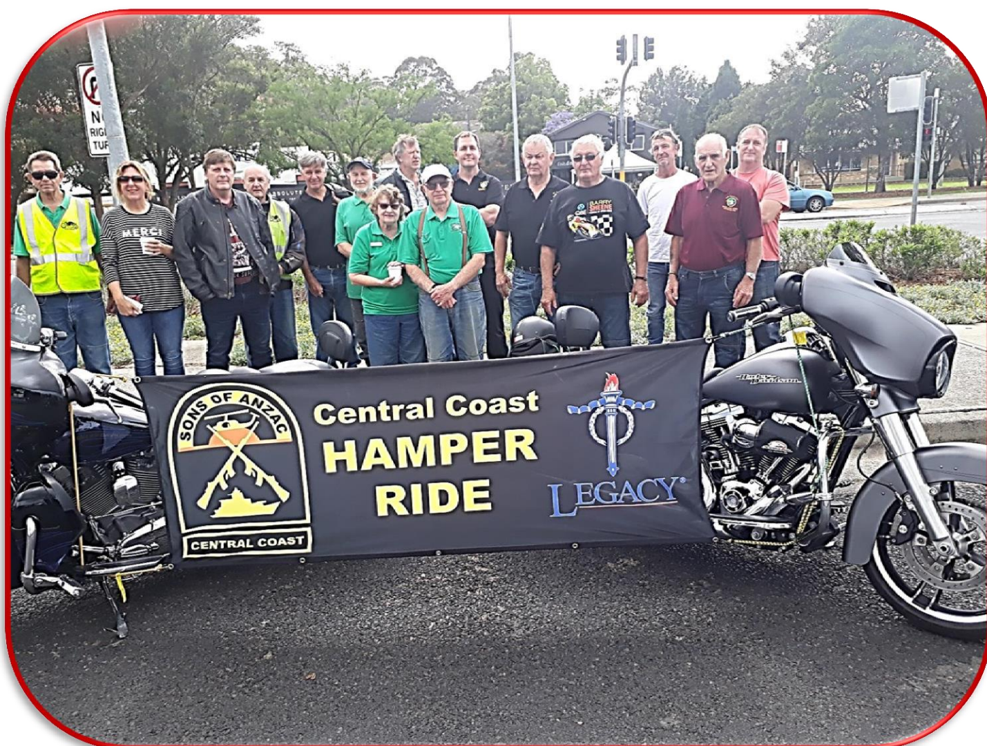
All the club members having ridden on the Hamper Ride Sunday November 4 th

Club Membership is by nomination only and is open to those persons interested in the restoration use and preservation of old motorcycles.