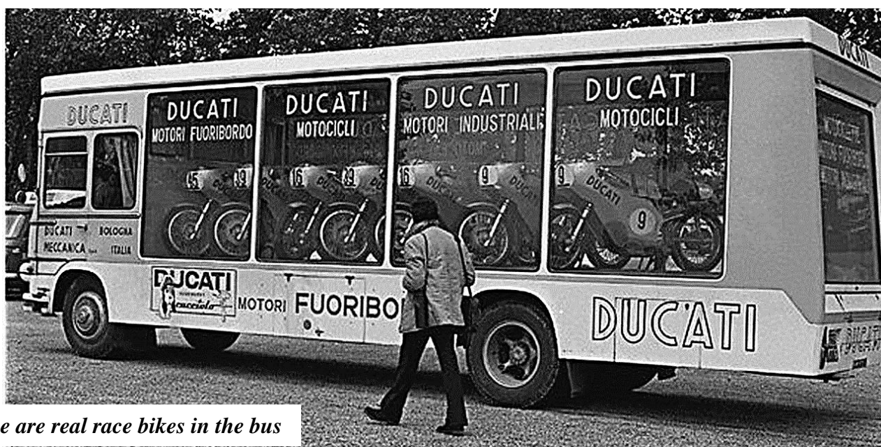
Those are real race bikes in the bus