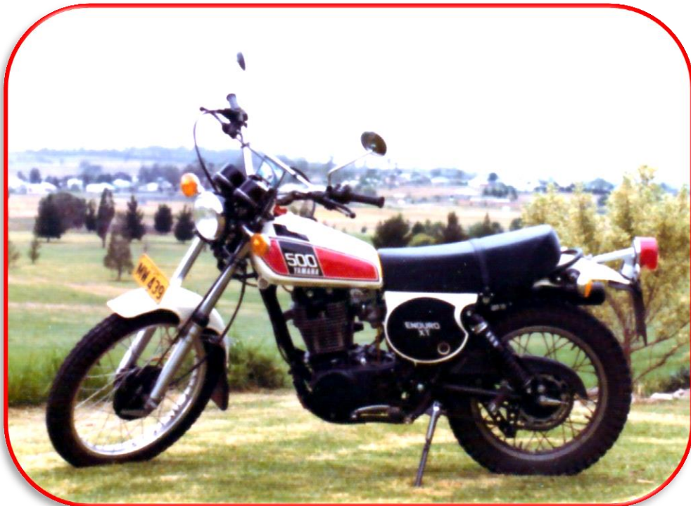
Spike's original 1976 XT500; 42 years on and the street versions are even more popular and still use basically the same power plant

Believe it or not, 42 years later I still have the second seal which of course I've never used however the budding romance with Leonie ended that day when I left her standing on the footpath with her foot covered in oil. More Next issue- Spike